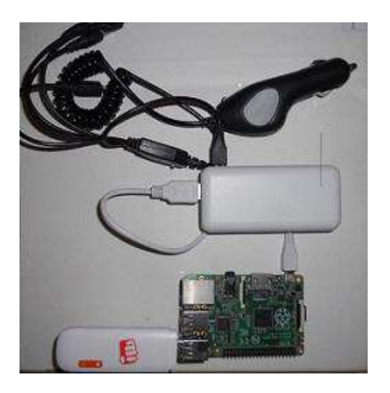
Figure 2: Hardware Connections

connect a 2G/3G/4G USB dongle. Alternatively, we can connect a USB Wi-Fi dongle to Raspberry Pi. Wi-Fi dongle should have access permanent access to a hotspot.