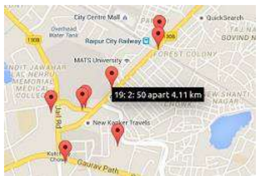
Figure 3: Latitude/Longitude point

Google Maps APIs expect a latitude and longitude pair to show the location on Google Maps in a browser window.Map.html has the JavaScript and HTML code for it. We can also track the distance from a starting point. We need to give the latitude and longitude of the starting point in map.html.We can display it on Google maps app on our smartphone or may be desktop based application.